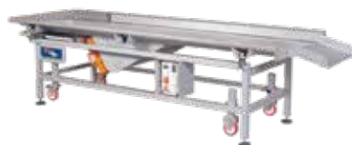
CMA - SV800