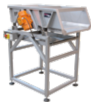
CMA - TV1