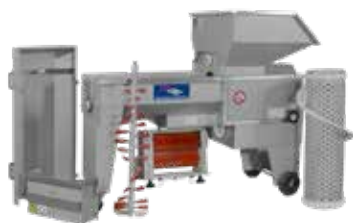
CMA - LUGANA 2R-TL