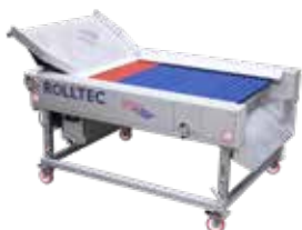
CMA - ROLLTEC