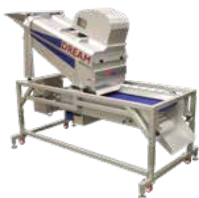
CMA - DREAM